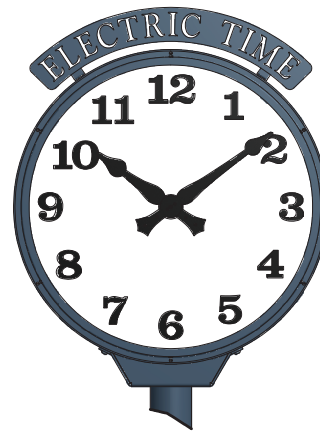
Optional Curved Header (with raised aluminum text)