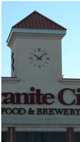
Granite City Food and Brewery Sioux Falls, SD