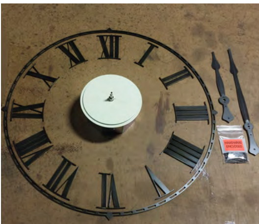
Style 1000 Front Access Clock with Special Trim Ring Prepared for Shipment