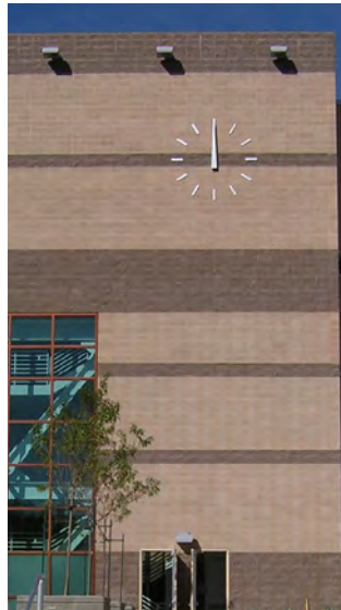
Port of Los Angeles Police Headquarters San Pedro, CA