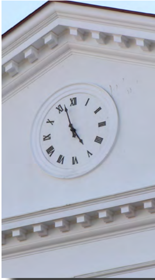
Darden School of Business - University of Virginia