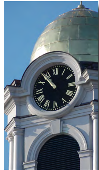
Needham Town Hall, MA