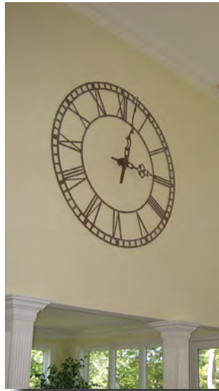
Great Room Private Residence