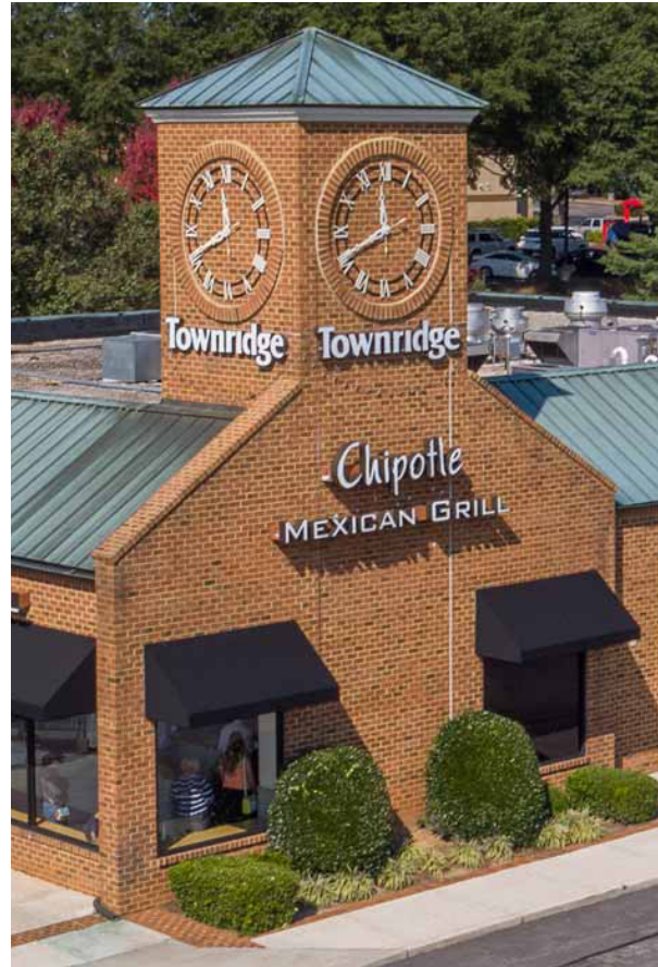
Townridge Square Shopping Center Raleigh, NC